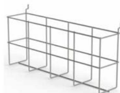
Wire Document Holder