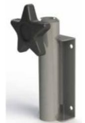
Bolt on IV Pole Bracket