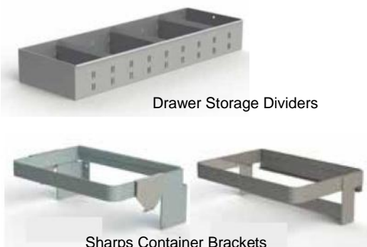
Drawer Storage Dividers

If you have requirements for a trolley custom features please contact with your specific requirements.