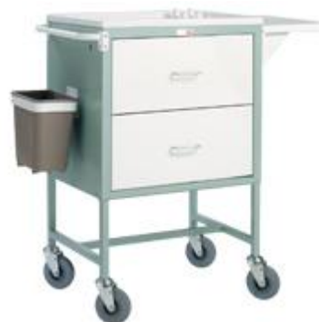
KH222WEB with options folding shelf and waste bin