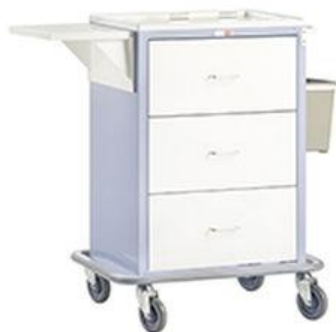
KH220WEB with options folding shelf and waste bin