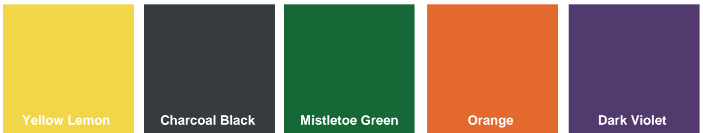
Non-Standard Powdercoat Colours (additional cost may apply)