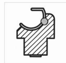
Miller 2 end-view

Compatible with all handles to the ISO 7376 (green standard).