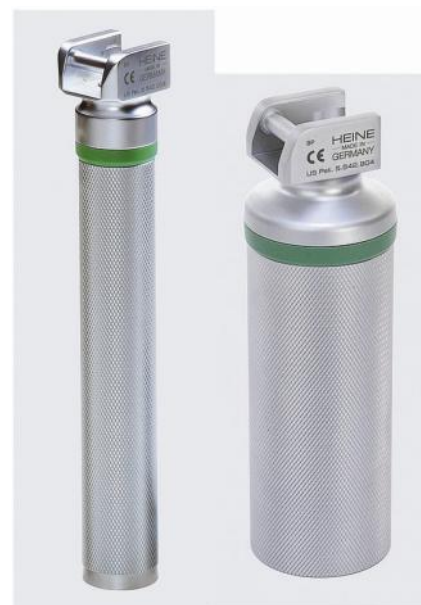
Left to Right: Slim and Short Heine Laryngoscope Handles