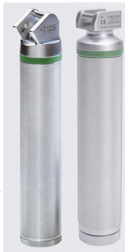
Left to Right: Standard Angled and Standard Heine Laryngoscope Handles