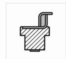
Paed 1 end-view

High quality stainless steel construction.