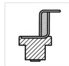
Mac 3 end-view

4000 standard autoclave cycles of 134°C / 4 min. with more than 1000 lux.