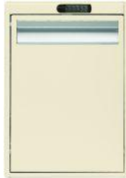
WALLAroo 6650 with Keypad Lock

WALLAroo 6650 Series Wall Cabinet offers the smallest wall storage in contoured, sculpted design that is ideal for small areas or rooms with space constraints. Ideally for holding small diagnostic equipment, tablets, medication, PPE and records.