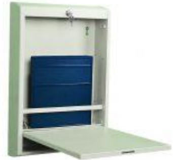
WALLAroo 6650 with Key Lock and Retaining Bar