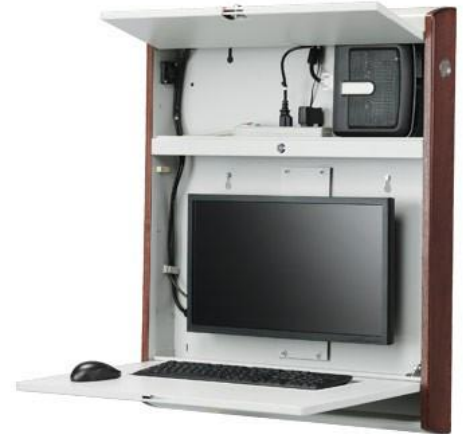
WALLAroo 6620 Series with key lock, monitor mount, vent caps and custom mounted drive