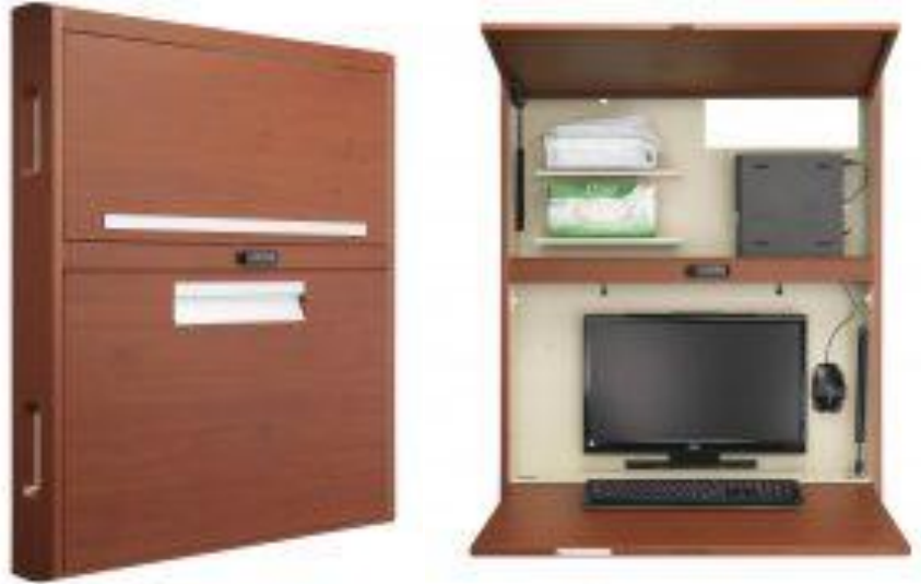
WALLAroo 6699 Series with Keypad Lock, Monitor Mount, Mouse House, Shelving Kit, Close Assist Doors, Vet Caps and Custom Mounted Drive

The WALLAroo® 6699 Series is the widest two-door WALLAroo® Carstens offers. It is great for storing wide screen monitors, tablets, charts, supplies and/or medications inside patient rooms.