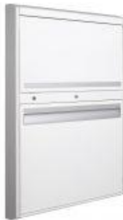
WALLAroo 6670 Series with Keypad Lock and Key Lock

The WALLAroo® 6670 Series takes up the same wall space as the WALLAroo® 6600 Series but with half the depth. The 10cm depth of the 6670 Series makes it great for storing electronic equipment inside patient rooms or just outside of patient rooms in the corridor.