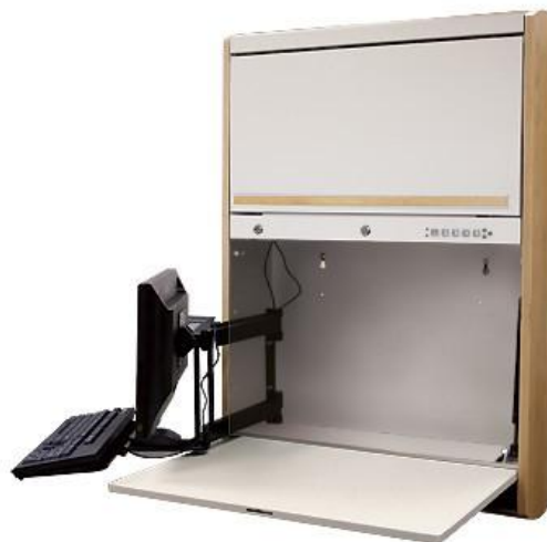
WALLAroo 6600 Series with Keypad Lock, Articulating Arm and Close Assist Doors

The WALLAroo® 6600 Series is the deepest WALLAroo® Carstens offers with an 20cm depth. This makes the 6600 Series great for storing electronic equipment and larger supplies inside patient rooms.