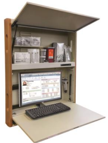
WALLAroo 6600 Series with Keypad Lock, Articulating Arm, Mouse House, Shelving Kit, Vet Caps and Close Assist Doors