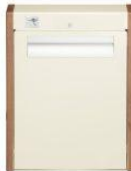
WALLAroo 53200 Series with keyed lock

Comes with three adjustable shelves mounted on vertical rails.