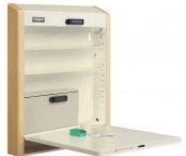
WALLAroo 53200 Series with keypad lock, Shelving Kit and Keypad Med box