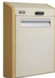
WALLAroo 53250 Series with keypad lock and Shelving Unit

Similar in size to the WALLAroo® 53200 Series but offers 5cm more depth. Comes with three adjustable shelves mounted on vertical rails.