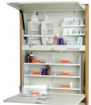
WALLAroo 6670 series with Keypad Lock, IV Retainer Bar, Shelving Kit, Storage Bins and Close Assist Doors