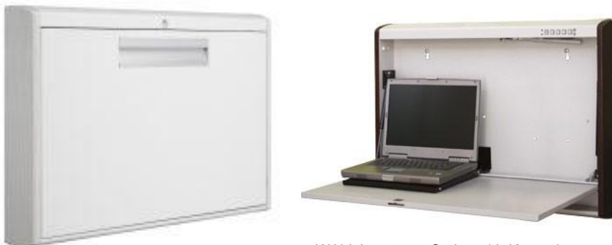
WALLAroo 6680 Series with Key Lock

The WALLAroo® 6680 Series has the same height and width as the 6610 Series but offers 5cm more depth to fit larger treatment necessities. It is ideal for storing small laptops, tablets, charts, supplies and/or medications inside patient rooms.