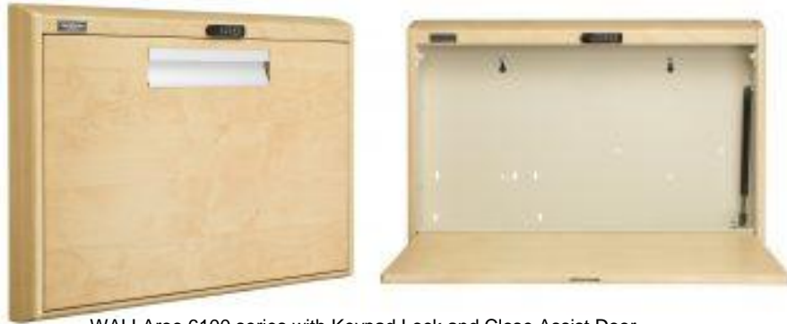
WALLAroo 6100 series with Keypad Lock and Close Assist Door

The WALLAroo® 6610 Series is ideal for storing monitors, laptops, charts, supplies or medications in a secure, convenient workstation. You can easily store essential medical supplies, files or equipment next to data entry technology without compromising space. Mount in the corridor or inside patient rooms