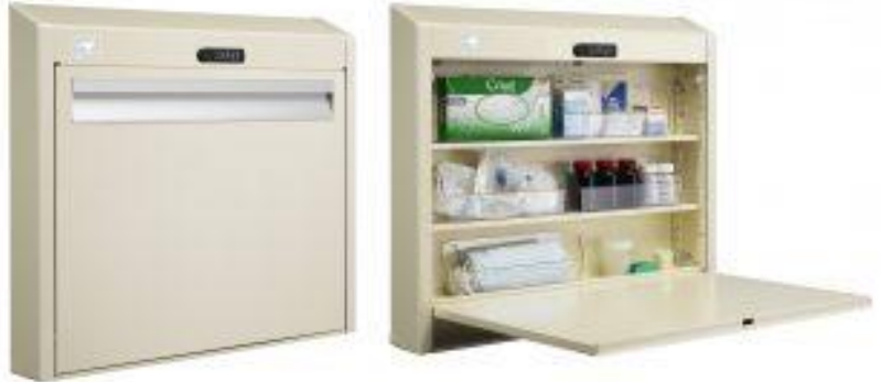
WALLAroo 53300 with Keypad Lock and Shelving Kit

The WALLAroo® 53300 Series is ideal for storing small electronic equipment, charts, supplies or medications in a secure, convenient workstation. Mount in the corridor or inside patient rooms to keep all treatment essentials at the point-of-care.