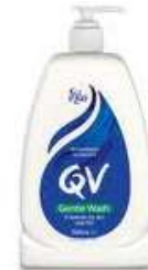
Ego body wash