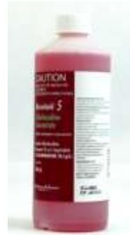
Microshield 5 Chlorhexidine concentrate