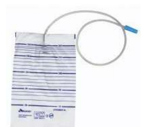
Urimaax Night Urine Bags