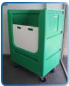
RTLET3 + Optional

Shelves can be used to slot in front to form large bin or used as shelves.