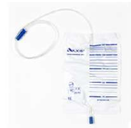
A1 Urological Drainage Bags