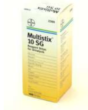
Multistix 10 SG