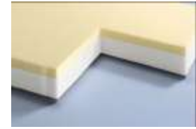
ViskoMatt Memory Foam