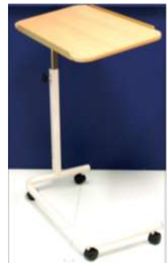
Overbed Table with Tilt Top & C Base