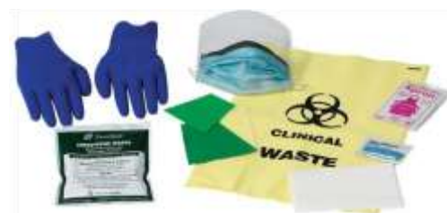
Contents of ZF306