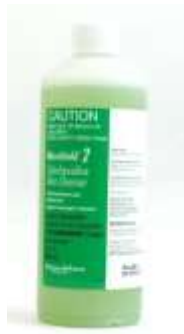
Microshield 2 Chlorhexidine skin cleanser