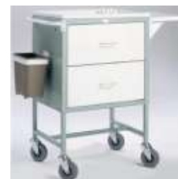
KH222WEBSTER + Folding Shelf + Waste Bin