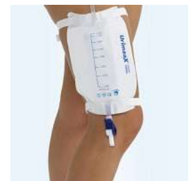
Urine Leg Bags