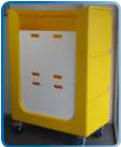
RTLET1 + Optional Shelf