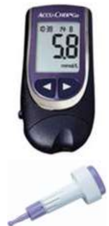
Accu-Chek Safe-T Pro Lancet - 3 adjustment depth settings