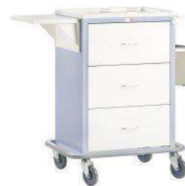
KH220WEBSTER + Folding Shelf + Waste Bin