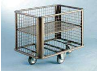
KH551B – Medium with Spring Loaded Base