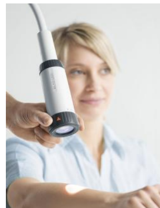
Adjusting spot size on EL10