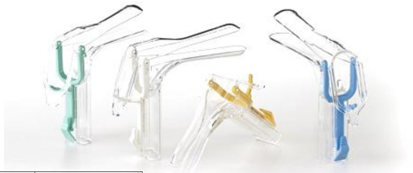
4 Models pictured from X-Small, Small, Medium and Large.