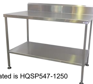
Illustrated is HQSP547-1250

Static benches are made of 304 Grade Welded Stainless Steel Benches come in a variety of lengths from 75cm to 2.25metres in increments of 25cm. ***When ordering please state the length required. Standard size 75cm (d) x 90 (h) excluding splash back 15cm Splashback 2 shelves. Lower shelf is 30cm from the ground Dry edge Height adjustable feet Customisable