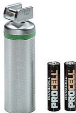
HF0122812 (batteries not included)